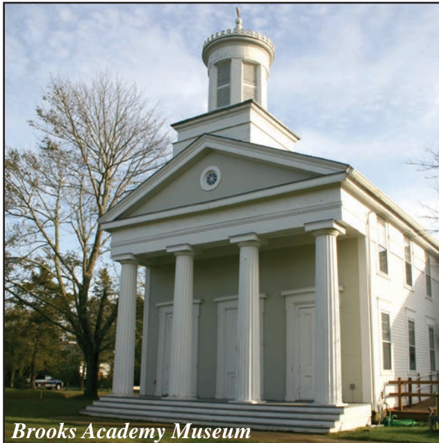
Brooks Academy Museum